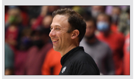
2nd Season at New Mexico