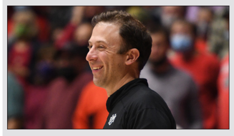
2nd Season at New Mexico