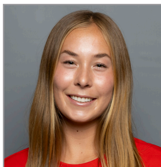
14 Alysa Whelchel