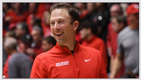
3rd Season at New Mexico