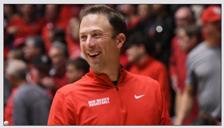
3rd Season at New Mexico