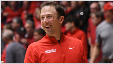
3rd Season at New Mexico