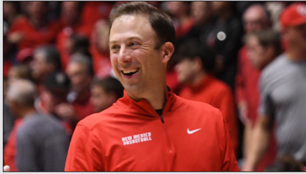
3rd Season at New Mexico