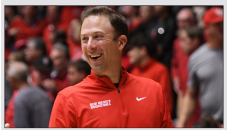
3rd Season at New Mexico