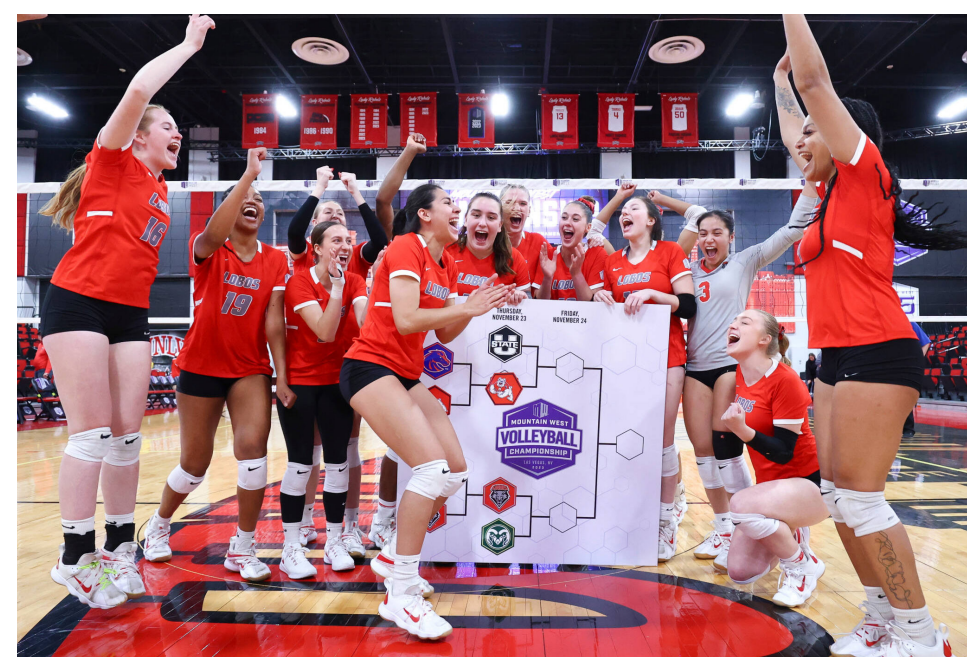
UNM's five-set win over UNLV in the 2023 Mountain West Tournament was its first win in the conference tournament since 2006, securing the Lobos' first-ever conference semifinal appearance under the current format.

tion against New Mexico Highlands on August 23: