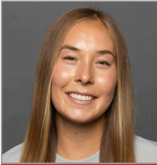
14 Alysa Whelchel