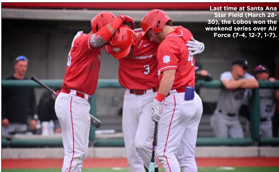
Last time at Santa Ana Star Field (March 28-30), the Lobos won the weekend series over Air Force (7-4, 12-7, 1-7).