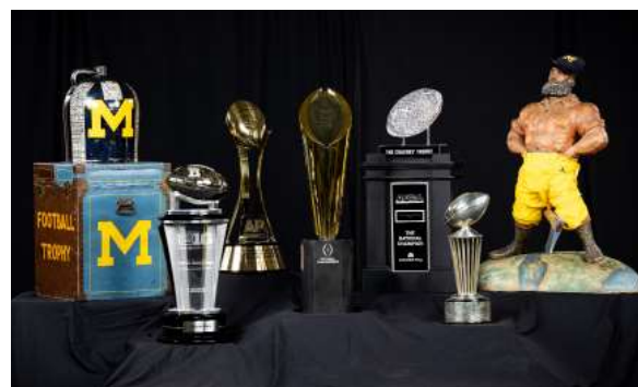
12 National Titles & 45 Big Ten Championships