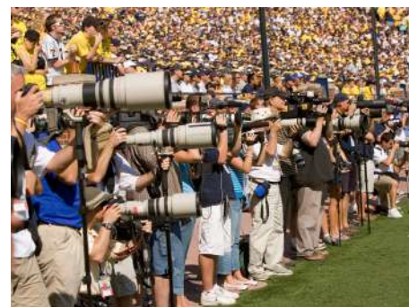
All-Time NCAA Leader in TV Appearances