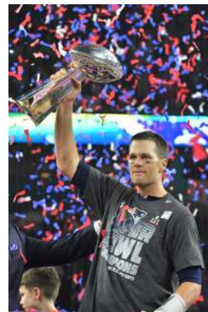
Tom Brady 7-time Super Bowl Champion 5-time Super Bowl MVP