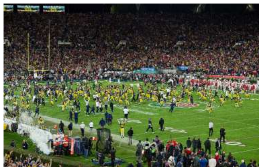
21 Rose Bowl Appearances The most of any Big Ten Conference school and the second-most all-time by any school