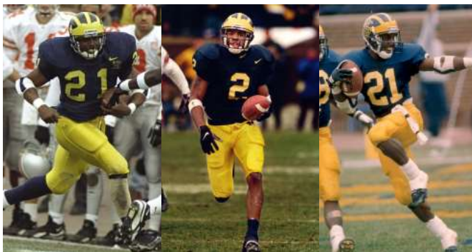
"The Game" between Michigan and Ohio State has been selected as the greatest rivalry in all of sports