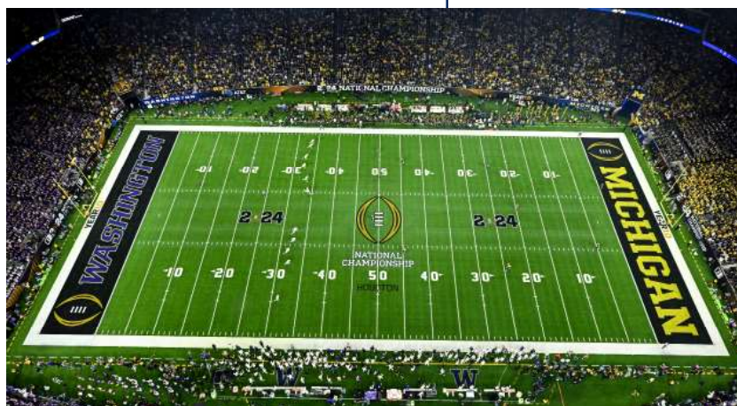
Three College Football Playoff Appearances: 2022, 2023, 2024