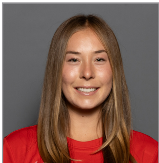
14 Alysa Whelchel