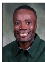
Abe Elimimian Secondary