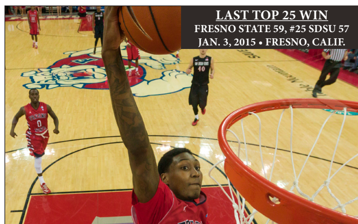
LAST TOP 25 WIN FRESNO STATE 59, #25 SDSU 57 JAN. 3, 2015 • FRESNO, CALIF.