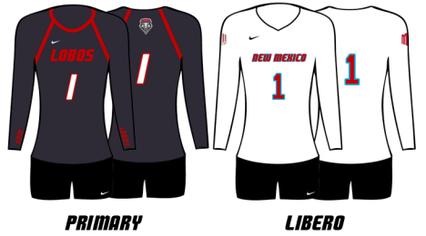
MATCH 6 · SEPTEMBER 2 NORTH DAKOTA 3, NEW MEXICO 0