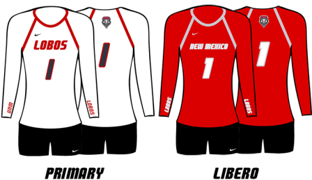
MATCH 10 · SEPTEMBER 15 NEW MEXICO 3, YOUNGSTOWN STATE 0