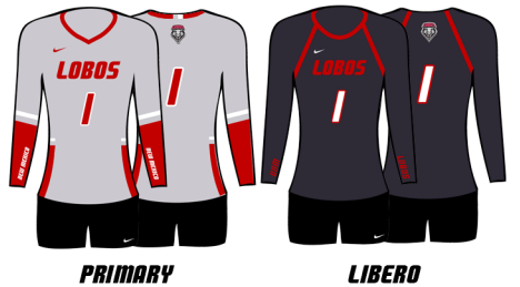
MATCH 9 · SEPTEMBER 9 NORTHERN COLORADO 3, NEW MEXICO 0