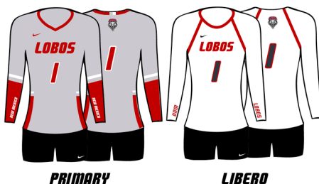
MATCH 14 · SEPTEMBER 23 NEW MEXICO 3, WYOMING 0