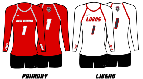
MATCH 12 · SEPTEMBER 16 NEW MEXICO 3, TENNESSEE TECH 1