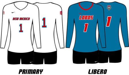
MATCH 7 · SEPTEMBER 8 NEW MEXICO 3, UT ARLINGTON 0