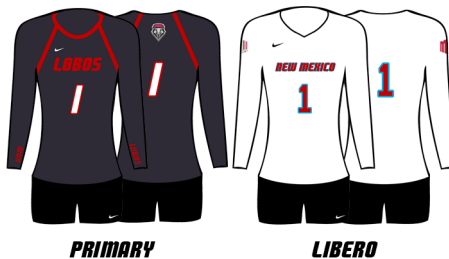
MATCH 11 · SEPTEMBER 15 TOLEDO 3, NEW MEXICO 1