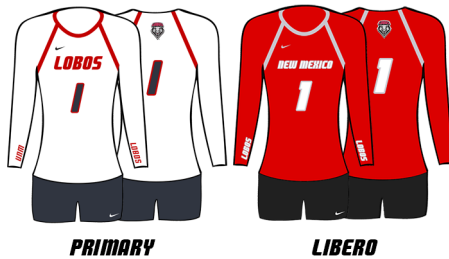
MATCH 8 · SEPTEMBER 8 NEW MEXICO 3, PORTLAND 2