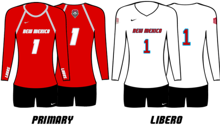
MATCH 1 · AUGUST 25 NEW MEXICO 3, NEBRASKA OMAHA 0