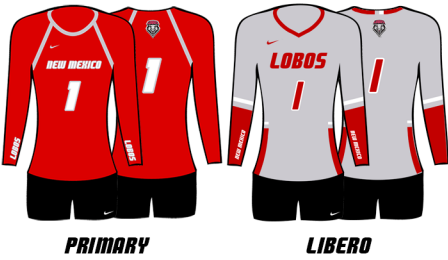
MATCH 4 · SEPTEMBER 1 NEW MEXICO 3, YOUNGSTOWN STATE 0