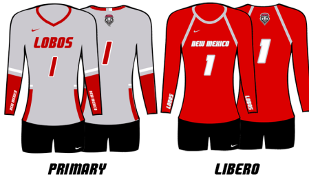
MATCH 5 · SEPTEMBER 1 NEW MEXICO 3, UTEP 0