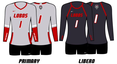
MATCH 9 · SEPTEMBER 9 NORTHERN COLORADO 3, NEW MEXICO 0