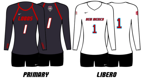
MATCH 6 · SEPTEMBER 2 NORTH DAKOTA 3, NEW MEXICO 0