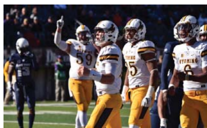
Cowboys Celebrate TD vs. Utah State