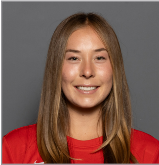
14 Alysa Whelchel