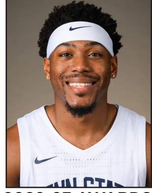
2022-23 AWARDS Naismith Player of the Year Midseason Team