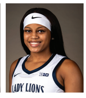
G | Fr./Fr. | 5-9 Plant City, Fla.