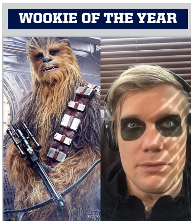
WOOKIEE OF THE YEAR

The Nittany Lions won games in consecutive years in the Big Ten Tournament for the first time since the 2000 and 2001 tournaments. In its last four Big Ten Tournament appearances, Penn State posted five wins, most in any four-year span since the tournament began in 1998.