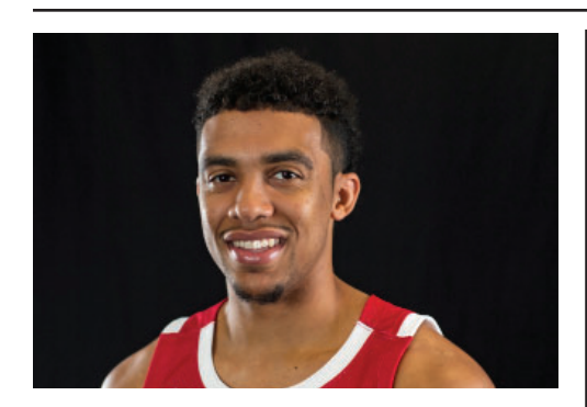
Twitter: @DMitrikTrice22 | Instagram: dmitrik_trice0