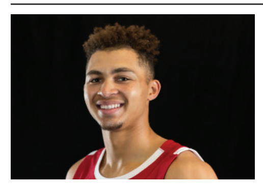
Twitter: N/A | Instagram: youngking_2323

R-Sophomore | Guard | 6-4 | 205 La Crosse, Wis. | Central High School