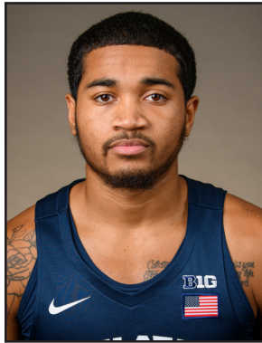
2021-22 AWARDS All-Tournament Team - Emerald Coast Classic

Sr. • Guard • 6-0 • 189 lbs. Philadelphia, Pa./The Shipley School Binghamton Major: Sociology