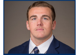
CANYON BIRCH #13 | FR. | ATTACK