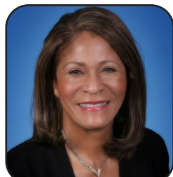
HEAD COACH C. VIVIAN STRINGER 51st SEASON 27th AT RUTGERS