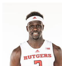
3 MAWOT MAG So. • 6-7 • 216 • F Melbourne, Australia