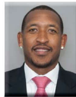
Chris Duhon Assistant Coach First Year