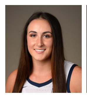
F | So./So. | 6-4 Franklin, Mass.