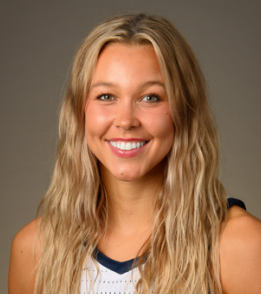
F | JR./Jr. | 6-3 Downingtown, Pa.