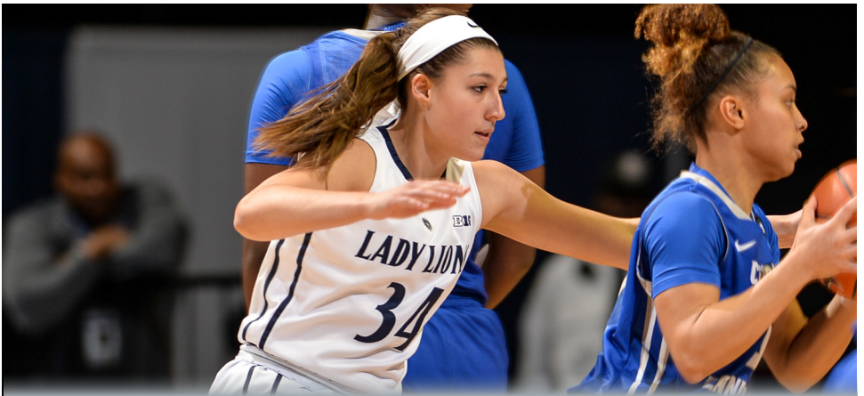
BIG TEN ROAD TEST AT MINNESOTA AWAITS LADY LIONS