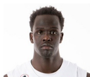
#3 - MAWOT MAG