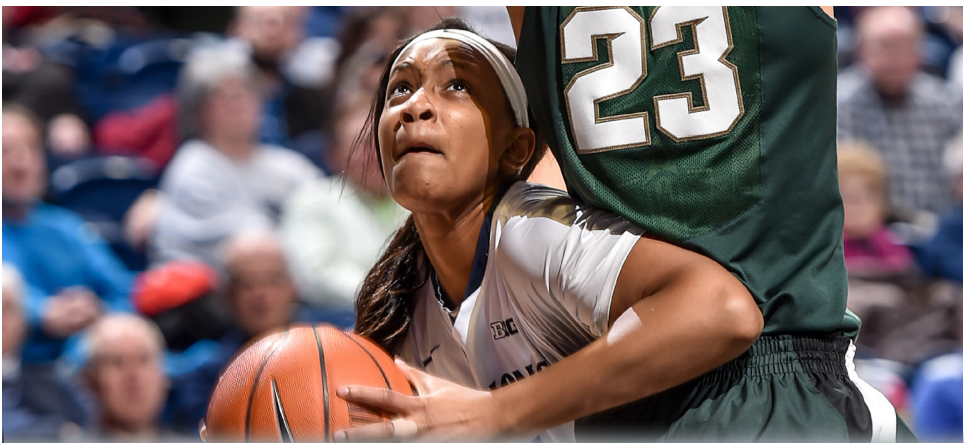
LADY LIONS FACE NEBRASKA IN BRYCE JORDAN CENTER ON WEDNESDAY