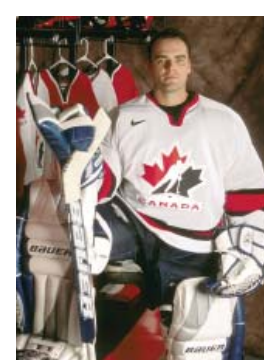
Curtis Joseph, a 2002 Olympic gold medalist, ranks among the top seven goaltenders in NHL history in victories.