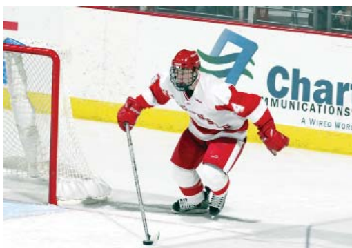
Defenseman Ryan Suter is in his 16th NHL season, now playing as an alternate captain for the Minnesota Wild after skating his first seven years with the Nashville Predators. A three-time NHL All-Star, Suter was alternate captain for Team USA at the 2010 and 2014 Olympics. Part of Team USA's first gold medal-winning world junior team in 2004, he is part of one of the great families in Wisconsin hockey history with his dad, Bob, winning gold with the 1980 U.S. Olympic Team. His uncle Gary won the 1986 Calder Trophy, the 1989 Stanley Cup, was a two-time Olympian and played 17 seasons in the NHL.