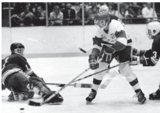
A 1983 NCAA champion at Wisconsin, Chris Chelios is a three-time Stanley Cup champion and a 2013 inductee into the Hockey Hall of Fame. The second-oldest player in NHL history, the longest-tenured American of all-time, and the NHL record-holder for most playoff games played, he won three Norris Trophies as the NHL's best defenseman. His NHL career included stops with Montreal, Chicago, Detroit and Atlanta. He played in four Olympics, captaining Team USA on three occasions, and served as assistant coach at the 2018 Olympics under current UW head coach Tony Granato.