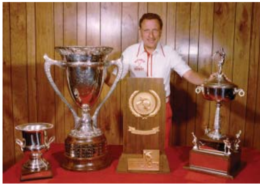
"Badger" Bob Johnson led the Badgers to their first three NCAA titles before moving on to coach in the NHL for the Calgary Flames and the Pittsburgh Penguins. He directed both teams to the Stanley Cup Final, leading Calgary there in 1986 and Pittsburgh to the title in 1991. Johnson also coached the 1976 U.S. Olympic Team. He was inducted into the Hockey Hall of Fame in 1992. The rink at the Kohl Center is named in his honor.