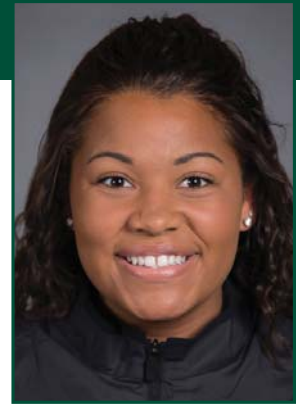
2015 Honors Big Ten co-Defensive Player of the Week (Sept. 21)

Sophomore • Defensive Specialist/Libero • 5-5 • Lakeville, Minn. / Lakeville North • Club: Northern Lights