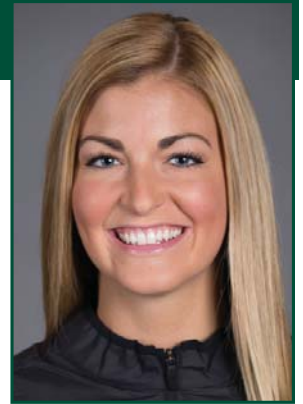
2015 Honors Preseason All-Big Ten

Junior • Outside Hitter • 6-4 • South Lyon, Mich. / South Lyon • Club: Michigan Elite