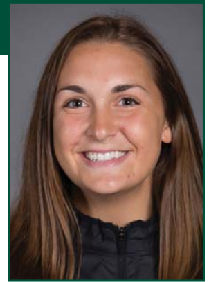
2015 Honors Bluegrass Invitational All-Tournament Team

Junior • Middle Blocker/Opposite • 6-2 • Georgetown, Ontario/Assumption Catholic Secondary • Club: Defensa