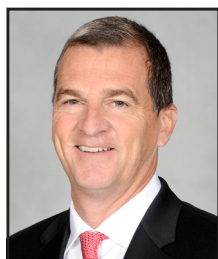
MARK TURGEON Head Coach 20th Season Overall, 7th Season at Maryland Kansas, '87