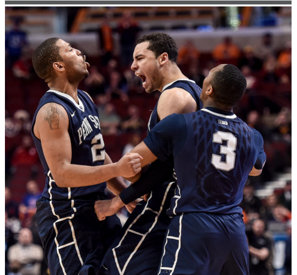
In its last appearance as the No. 13 seed, Penn State advanced to the quarterfinals in 2015, winning its first tournament games since 2011.

L, 70-71 @ PSU, 2/28/27 L, 75-79 @ Big Ten Tourn., 3/10/16 L, 66-46 @ OSU, 1/25/16 L, 67-77 @ PSU, 3/4/15 L, 55-75 @ OSU, 2/11/15 W, 65-63 @ PSU, 2/27/14 W, 71-70 (OT) @ OSU, 1/29/14 L, 51-65 @ PSU, 1/26/13 L, 54-78 @ OSU, 1/25/12 L, 60-71 @ Big Ten Tourn., 3/13/11