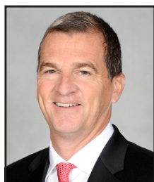
MARK TURGEON Head Coach 21st Season Overall, 8th Season at Maryland Kansas, '87