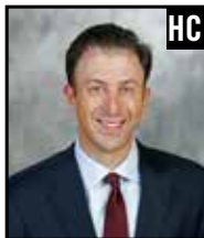
Richard Pitino Fifth Season Providence, '05