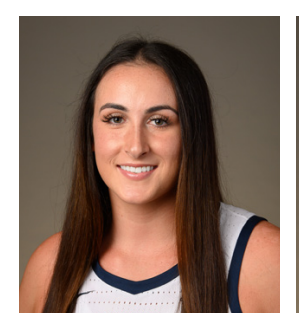
F | So./So. | 6-4 Franklin, Mass.