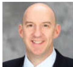
HUGH McCUTCHEON HEAD COACH