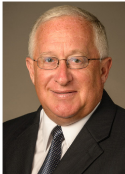
Russ Rose Head Coach