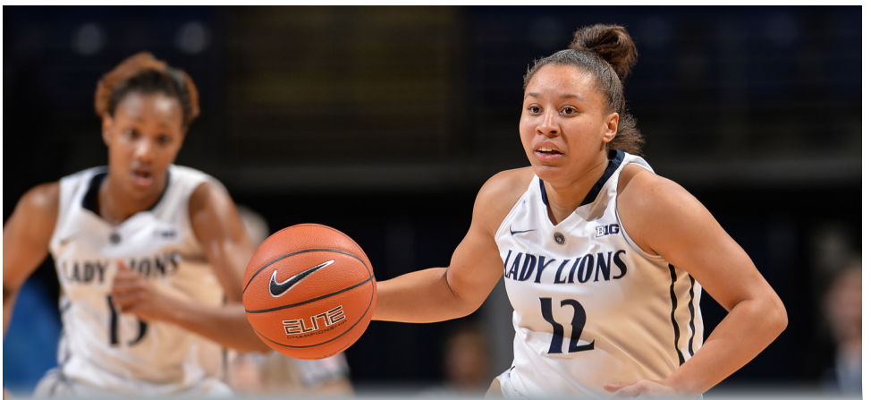
PENN STATE HOST VIRGINIA TECH IN BIG TEN/ACC CHALLENGE