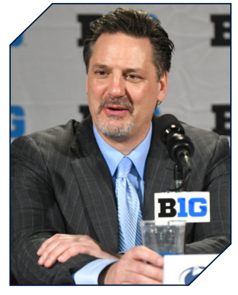
the program-best 25 victories.

The 2016-17 Nittany Lions also set numerous single-season team records on offense, including most goals (160), assists (265), points (425), shots (1,719), goals/gm (4.10) and shots/gm (44.1) to go along with