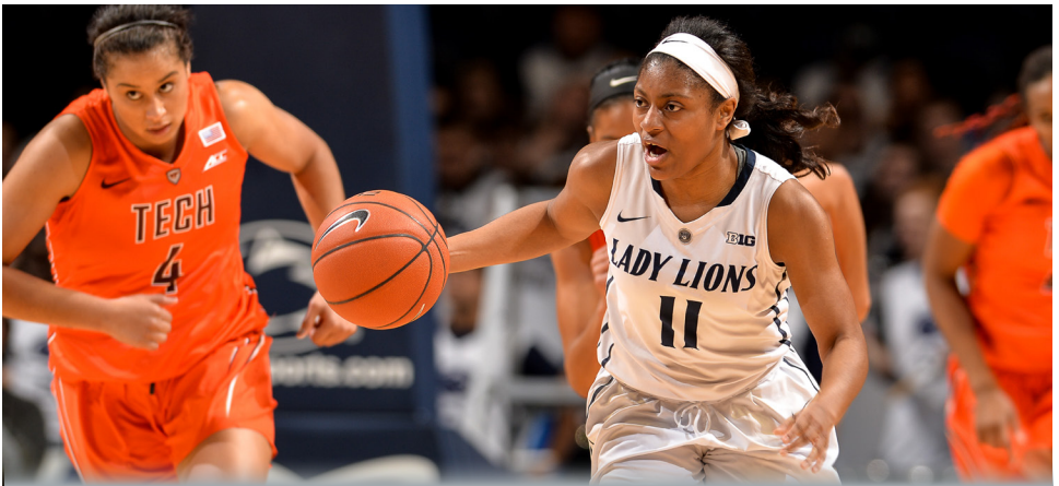
B1G PLAY ARRIVES IN THE FORM OF NORTHWESTERN ON NEW YEAR'S EVE