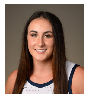
F | So./So. | 6-4 Franklin, Mass.