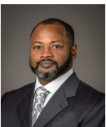
Terry M. Smith Cornerbacks Field