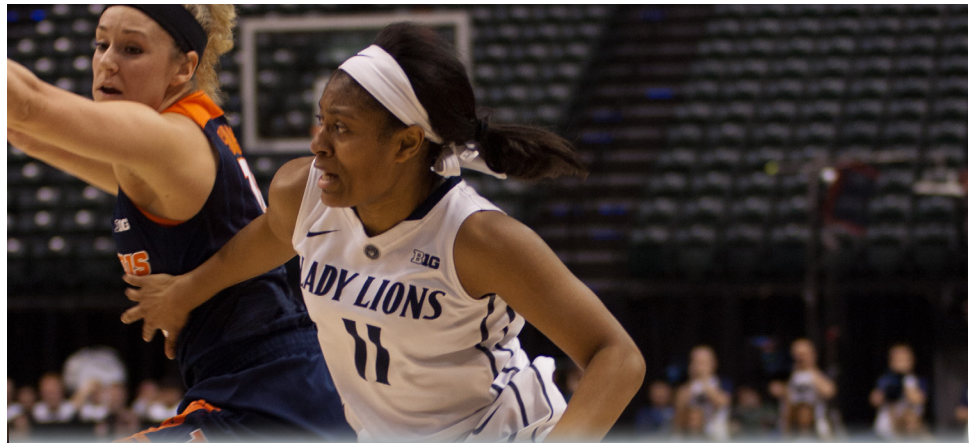
LADY LIONS ADVANCE TO FACE PURDUE IN SECOND ROUND OF B1G TOURNAMENT