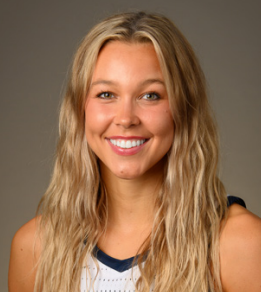
F | JR./Jr. | 6-3 Downingtown, Pa.