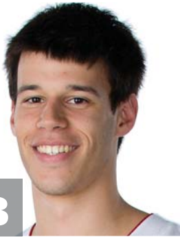
Dukan's complete bio

R-Senior ■ Forward 6-10 ■ 218 ■ Deerfield, Ill.