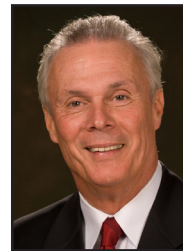
Bo Ryan Head Coach