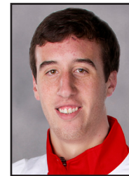
44 Frank Kaminsky F, Sr., 7-0, 234 Lisle, Ill.