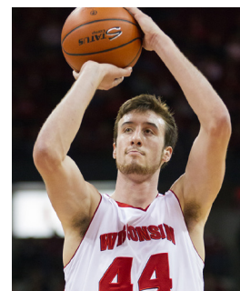
Reigning Big Ten Player of the Week Frank Kaminsky is the only player in the nation averaging at least 17.0 points, 8.0 rebounds, 2.0 assists and 1.5 blocks per game.

11 AT HOME ON THE ROAD: Wisconsin is 26-6 (.813) away from home over the last two seasons, owning the most road/neutral wins and 2nd-best win pct. away from home among major conference teams.